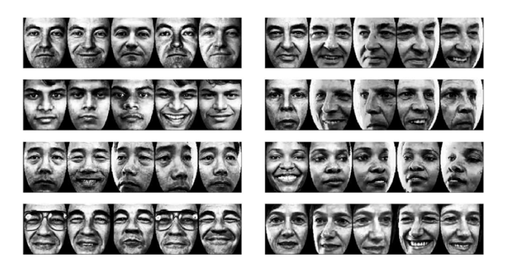
Fig. 4. Examples for six subjects drawn from the two normalized FERET subsets, \mathcal{G}_1 and \mathcal{G}_2 .

preprocessing sequence is applied. For the computational purpose, each image is finally represented as a column vector of length J = 17154.