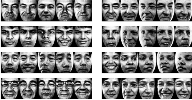
Fig. 4. Examples for six subjects drawn from the two normalized FERET subsets, \mathcal{G}_1 and \mathcal{G}_2 .

preprocessing sequence is applied. For the computational purpose, each image is finally represented as a column vector of length J = 17154 .